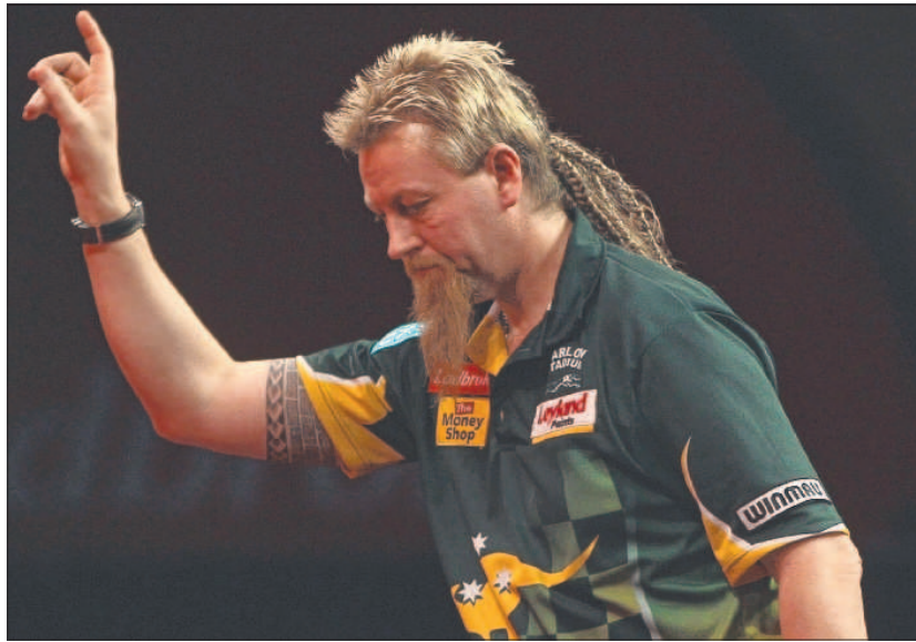
RECOVERING: Aussie Simon Whitlock lost to Andy Hamilton in the world darts championship semi-final.

"I should not have even been walking, I was told."